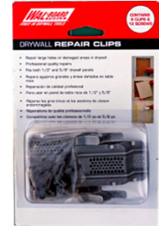
DRYWALL REPAIR CLIPS