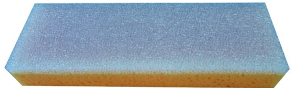
DUSTLESS ANGLED DRYWALL SANDING SPONGE

8 7/8" x 3 7/8" x 1 5/8" (47.63 x 98.43 x 41.28mm)