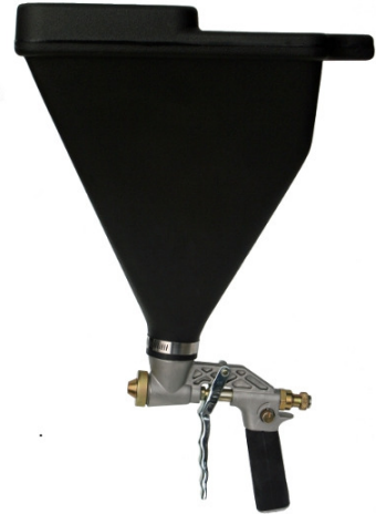
SPRAY-PRO® HOPPER GUN