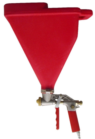
TEXTURE-PRO® 200 HOPPER GUN