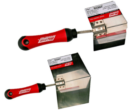
INSIDE CORNER TOOLS