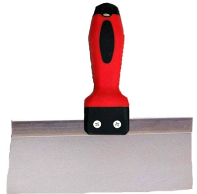
STAINLESS STEEL TAPING KNIFE