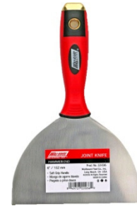
SOFT GRIP HAMMER-END KNIFE