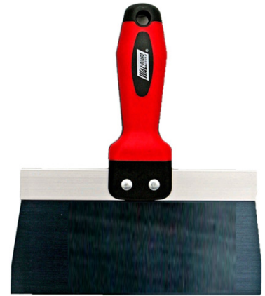
BLUE STEEL TAPING KNIFE