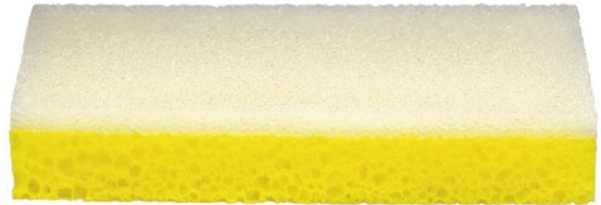
DUSTLESS DRYWALL SANDING SPONGE

8 7/8" x 4 1/2" x 1 5/8" (47.63 x 114.3 x 41.28mm)