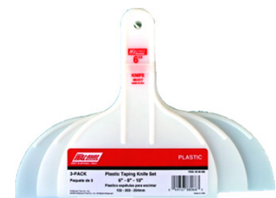
3 PACK PLASTIC KNIVES